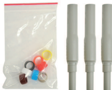
Optional Fuse Adapter Kit (1008-645)

Includes 4 adapters with multiple color straps.