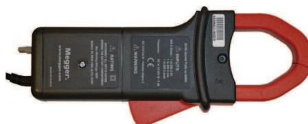
Hall Effect Current Clamp 600 A dc and 400 A ac