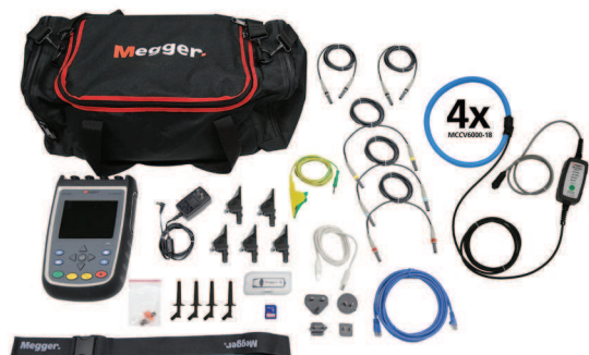
MPQ1000 Silver Plus Kit C/N MPQ1000-S-KIT-PLUS

Includes MPQ1000 analyzer, voltage leads, SD card, USB cable, ethernet cable, universal power adapter, soft-sided carry bag, plus hanging strap, voltage lead plunger clips, and 4 MCCV6000-27 (four range flex 27 cm ID) CTs