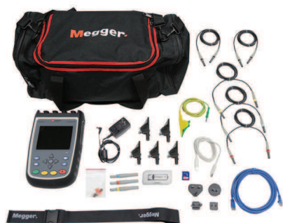
MPQ1000 Basic Kit C/N MPQ1000-BASIC

Includes MPQ1000 analyzer, voltage leads, SD card, USB cable, ethernet cable, universal power adapter, soft-sided carry bag plus fuse adapters and hanging strap. Does not include current clamps.