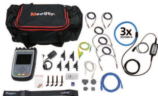
MPQ1000 Silver Kit C/N MPQ1000-S-KIT

Includes MPQ1000 analyzer, voltage leads, SD card, USB cable, ethernet cable, universal power adapter, soft-sided carry bag, plus hanging strap, voltage lead plunger clips, and 3 MCCV6000-27 (four range flex 27 cm ID) CTs