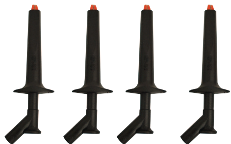
Optional Plunger Clips (1008-756)