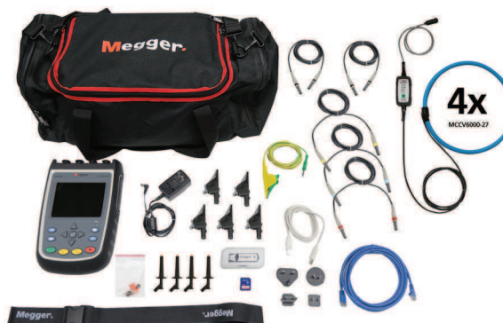
MPQ1000 Gold Plus Kit C/N MPQ1000-G-KIT-PLUS

Includes MPQ1000 analyzer, voltage leads, SD card, USB cable, ethernet cable, universal power adapter, soft-sided carry bag, plus hanging strap, voltage lead plunger clips, and 3 MCCV6000-18 (four range flex 18 cm ID) CTs