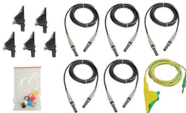
MPQ1000 Voltage Lead Set (2007-259)