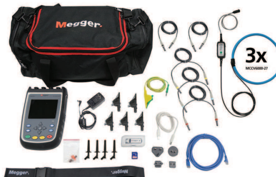
MPQ1000 Gold Kit C/N MPQ1000-G-KIT

Includes MPQ1000 analyzer, voltage leads, SD card, USB cable, ethernet cable, universal power adapter, soft-sided carry bag plus fuse adapters and hanging strap. Does not include current clamps.